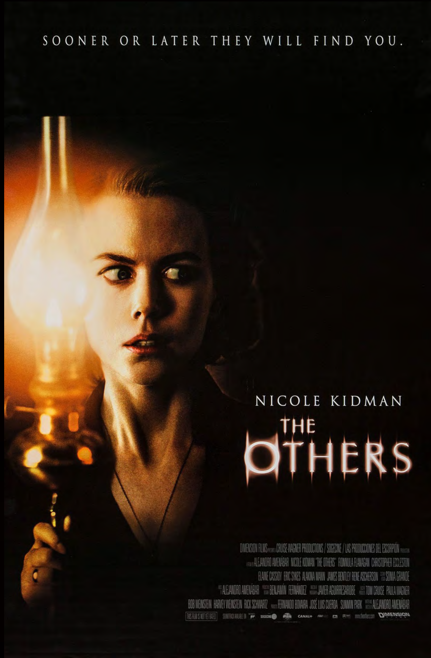
B.O. $210m USD