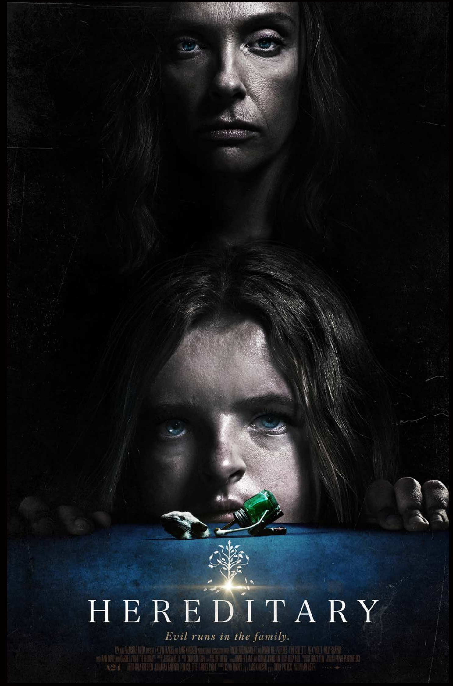
B.O. $80m USD