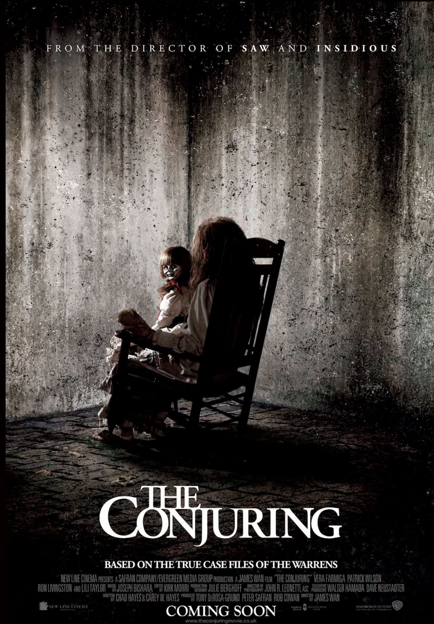
B.O. $320m USD